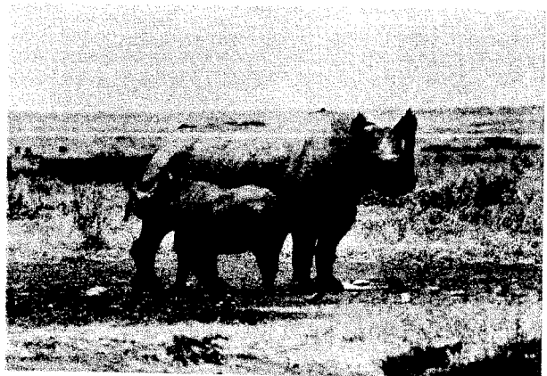
FIG. 1. Diceros bicornis in Nairobi National Park; subadult male and young.

DIAGNOSIS. Diceros bicornis (Fig. 1) is a dicerotine rhinoceros with anterior dentition absent or rudimentary, and occipital crest protruding posteriorly. The jaws and nasals abruptly end not far in front of the level of the anterior premolars; the mandibular