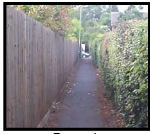
Footpath at London Road, Worcester

Footpath: For pedestrians only and situated away from the carriageway.