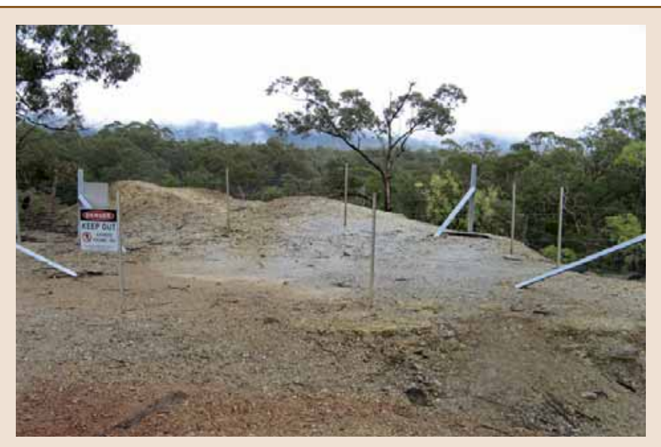
Fencing and signage was not a long-term management solution.