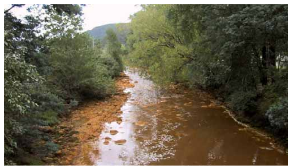
Acid drainage affected King River, Tasmania, downstream from Mount Lyall Copper Mine.

While the main impact of AMD is on environmental values, in extreme cases it can potentially affect human health through contamination of water supplies and heavy metal take-up in aquatic organisms used as food. Managing acid and metalliferous drainage (DITR 2007) details the underlying geochemistry and the impacts of poorly managed drainage, and includes case studies of best practice management.