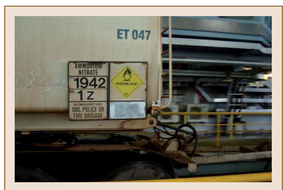
Transporting hazardous substances