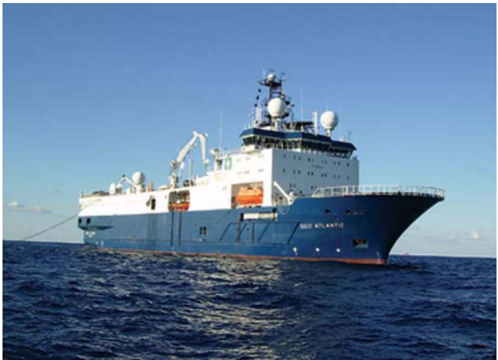
Figure 1: Seismic survey vessel M/V Geo Atlantic

A supply vessel, the M/V Tanux 1 , will accompany the seismic survey vessel to maintain a safe distance between the survey array and other vessels, and also to manage interactions with fishing activities, if required. The supply vessel will also resupply the survey vessel with fuel and other logistical supplies. The support vessel will have a crew of around 15 personnel.