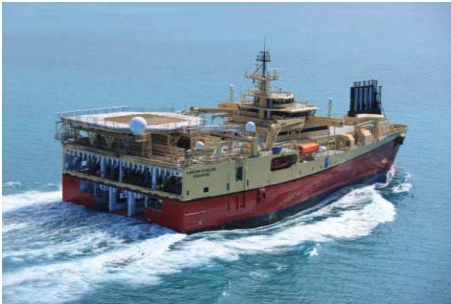
The Ramform Sterling

The seismic data acquisition will use the purpose-built seismic survey vessel M/V Ramform Sterling using two acoustic sources and 12 hydrophone streamers towed at a depth of approximately 6m, with a total length of approximately 5,200m and array breadth of approximately 1100m. The acoustic sources will be towed in front of the streamers with a lateral separation of approximately 50 m.