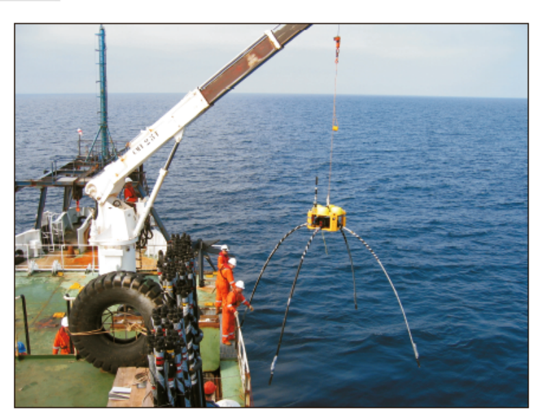
CSEM SURVEY ENVIRONMENT PLAN - SUMMARY