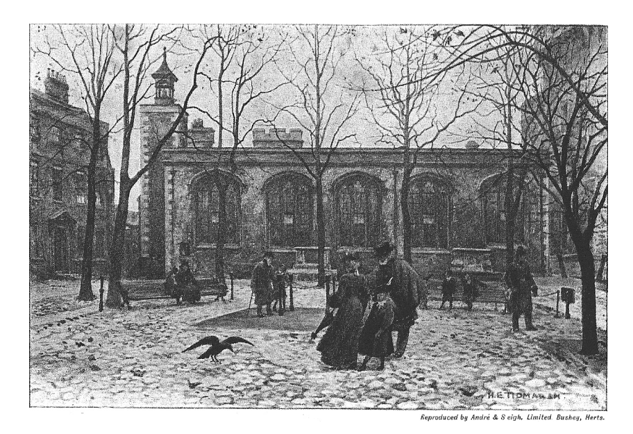
Figure 2. H. E. Tidman, Place of Execution in Front of St. Peter's Chapel.

to a sleeping animal and tweak its tail, quickly jumping back or flapping up to a higher perch before the enraged animal can retaliate" (p. 116). The cat in the illustration, who appears startled and puzzled, is looking down at the raven; however, the raven is not reciprocating the gaze, and there is no suggestion that the teasing is mitigated by affection.