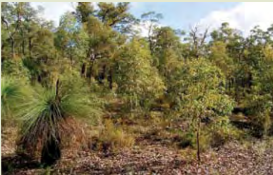
Left: Dieback Rehabilitated Area, Alcoa

This successful partnership between industry research groups and the State Government led to the improvement of degraded vegetation communities around the mining area.