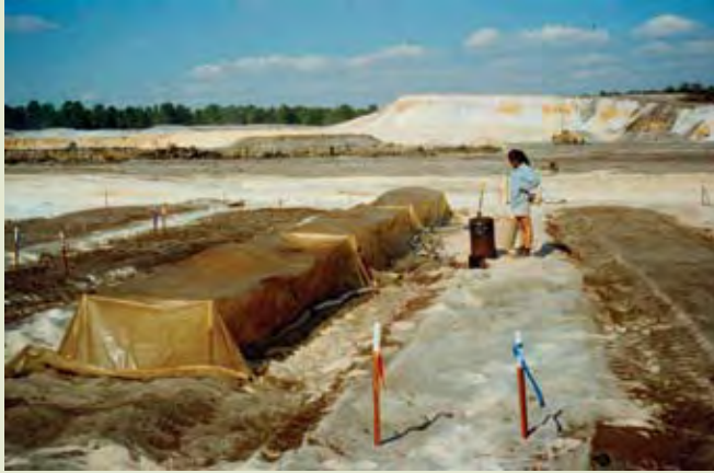
Above: Smoke being applied in aerosol form to audit seed bank diversity and quantity from stockpiled topsoil, K. Dixon

In 2004 a Western Australian research group isolated and identified a compound from smoke (a butenolide) that enhances seed germination to the same level observed for plant-derived smoke. The butenolide induces germination in a comprehensive and indicative selection of species known to be smoke-responsive including native species from California, South Africa, Australia and a range of horticultural and crop species. Research is now focused on deriving chemical analogues for more effective rehabilitation opportunities as well as investigating the mode of action of the molecule in native and agricultural species. This discovery represents a highly significant advance in rehabilitation sciences, with significant practical implications.