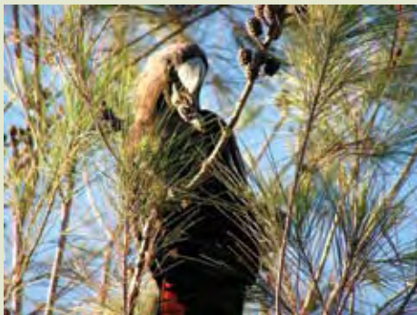
Above: Glossy black cockatoo, courtesy of Adrian Canaris, Biodiversity Assessment and Management (BAAM)

Faced with a fauna management challenge, CRL embarked on a program to survey the entire island for the presence of Glossy Black Cockatoos, to determine its conservation status across the several thousand hectares of potential habitat. Through the use of an