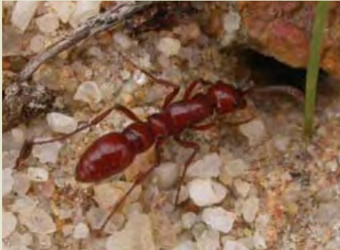
Above: Cerapachys Princes: Predatory ant favoured in restored sites, A.Gove

for amphibians, reptiles and mammals. Given that plants are known to be poor indicators of invertebrate biodiversity, vegetation and floristic monitoring alone would not give a true picture of the extent of biodiversity recovery.