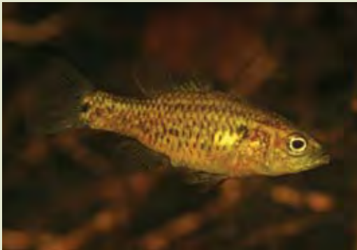
Above: Male Pygmy Perch, CRL

In 2000, the Oxleyan Pygmy Perch ( Nannoperca oxleyana ), listed as 'endangered' under the Commonwealth Environment Protection and Biodiversity Conservation Act 1999 and 'vulnerable' under the Nature Conservation Regulation 1994 (Qld), was found at Little Canalpin Creek.