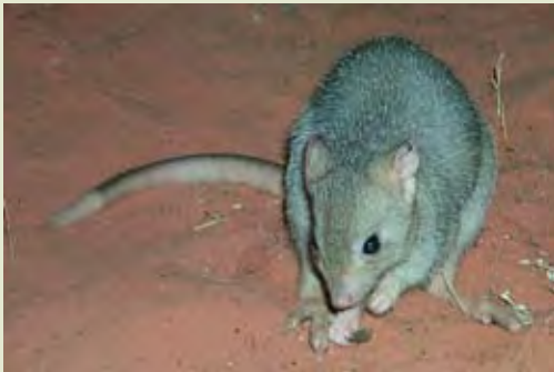
Above: Burrowing Bettong, BHP Billiton

All feral cats, rabbits and foxes were eradicated from the reserve after thousands of hours of work by staff, students and volunteer labour. This created a protected area where four locally extinct species were successfully reintroduced, namely the Greater Stick Nest Rat, the Burrowing Bettong, the Greater Bilby and the Western Barred Bandicoot. All four species are now living and breeding within the reserve. Numbats have been released on trial and Woma Pythons will also soon be reintroduced as part of Arid Recovery's plan to recreate a self-sustaining and functioning ecosystem within the reserve.