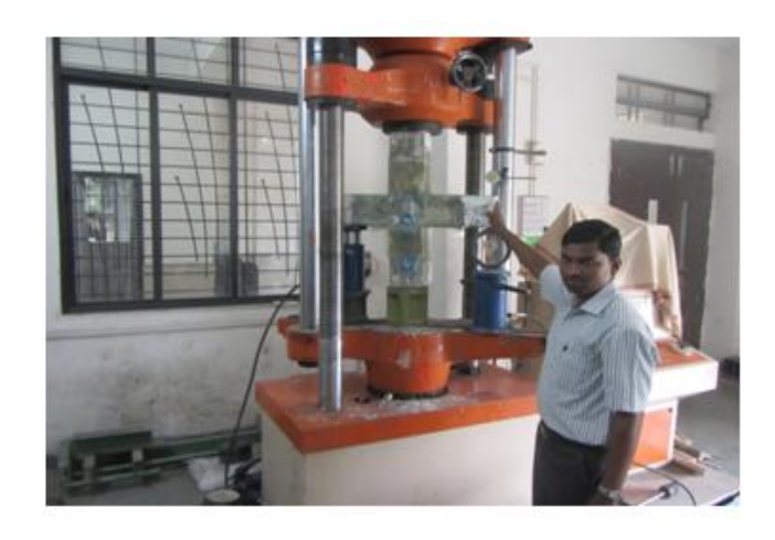
Fig.3 Test setup glass specimen.