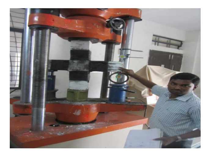
Fig.3 Test setup carbon specimen Load Study:

With reference to the test results, the load on ordinary specimens at first crack stage are compared to the load on