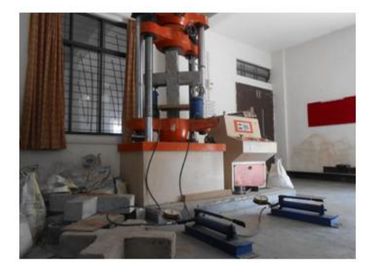
Fig.1 Test setup ordinary specimen.