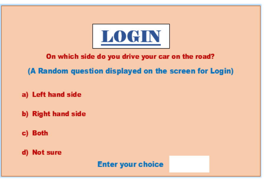
Fig 1. Random question displayed on Login screen

Later when the user tries to log in with his user name, he will be posed a random question on the screen. This question will be purely random and even the user doesn't know what the question and answers are. The question may be any situation or may be a suggestion to a problem from the user with which we try to match his thinking from the data he entered while registration. The data which he entered and answered while registration will be correlated with the question and answer he has given while logging in. The answer will be matching with his way of thinking and only on matching he will be logged in. If the answer he entered is mismatched, then the system identifies that it is not the exact user who registered.