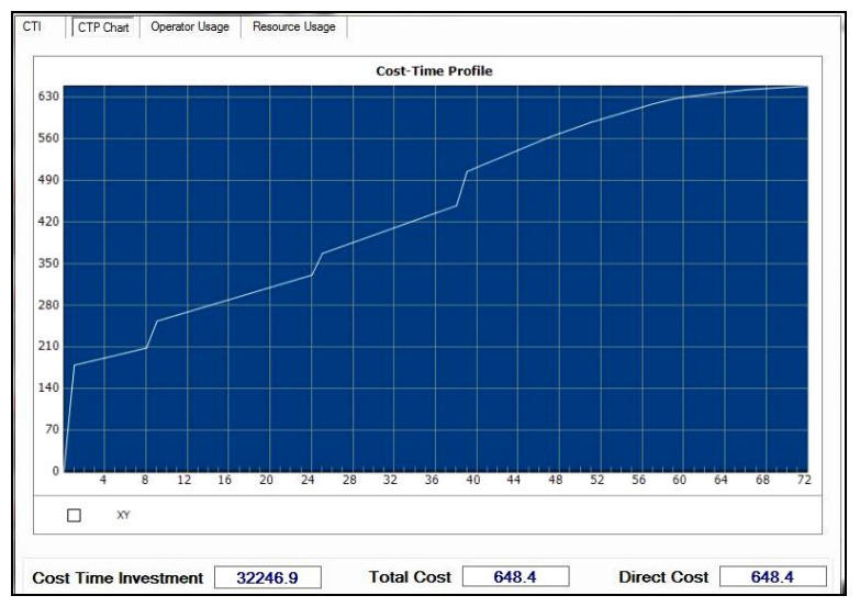
Figure 3. Cost-time profile for the MS dispatching rule (best CTI result).