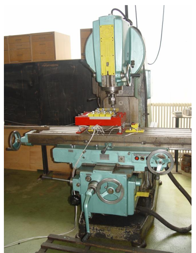
Figure 4. Vertical milling machine used in FSW method.

Figure 5 presents the welded workpieces on the upper side or the side from which the welding is performed.