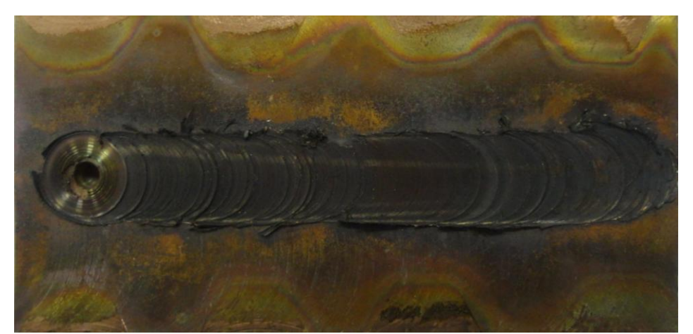
Figure 5. The appearance of the welded joint with the upper side of the welded workpieces

Figure 5 presents the welded workpieces on the upper side or the side from which the welding is performed.