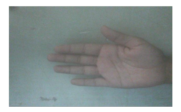
Fig 2: orignal hand image