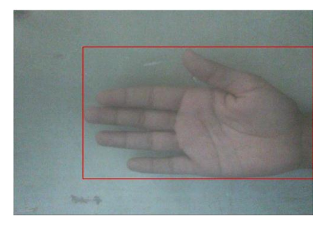
Fig 3: hand detection