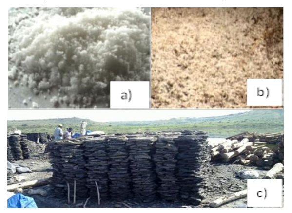
Figure 3 – the three grades of salt obtained from Lake Katwe: a) Grade I; b) Grade II and c) Grade III also known as Rock Salt

A closer look at the rock salt shows that it is stratified, and the layers are formed by different constituents due to their sequential crystallization as can be seen in Figure 5