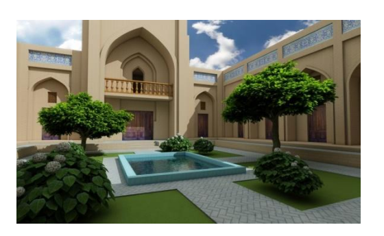
III. 3. KhodjaAkhror madrasah inner court yard (left: photo, right: design proposal)