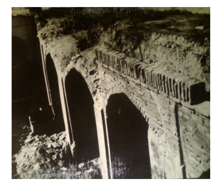
III. 5. Entrance portal of KhodjaAkhror madrasah; Part of the inner court yard of KhodjaAkhror madrasah