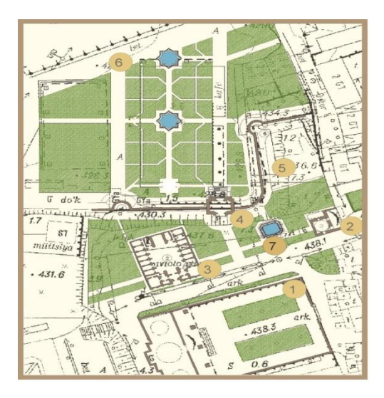
III.8. Project master plan: