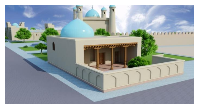
III. 6. KhodjaAkhror block mosque (left: current state, right: reconstruction proposal)