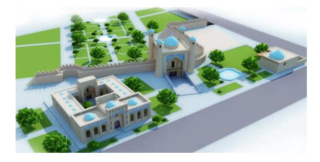
III. 7. The general view of the design proposal on KhodjaAkhrorVali complex.