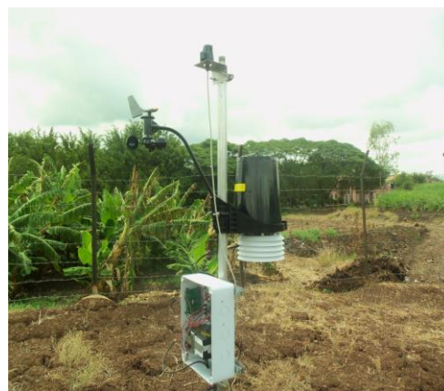
Figure 3.1 Integrate sensor suite at field

The Integrated Sensor Suite (ISS) collects outside weather data and sends the data to a Weather control station. The standard version of the ISS contains a rain collector, temperature sensor, humidity sensor and anemometer. In addition to the standard weather features, the ISS Plus adds a pre-installed solar radiation sensor and an ultra-violet (UV) radiation sensor. Temperature and humidity sensors are mounted in a passive radiation shield to minimize the impact of solar radiation on sensor readings. The anemometer measures wind speed and direction and can be installed adjacent to the ISS or apart from it. On an ISS Plus, the additional solar and UV sensors are mounted next to the rain