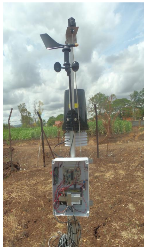
Figure 5.1 Experimental setup at field