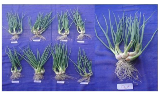
Figure 3. The effect of different treatments on shallot growth and bulb formation

According to Coolong et al. (2004), Sumarni et al. (2012), Sharma et al. (2003), Kumar et al. (2001), and Singh et al. (1997) found that the application of inorganic fertilizer N, P and K with the addition of organic fertilizers can increase nutrient uptake and yield of shallot to 30%.