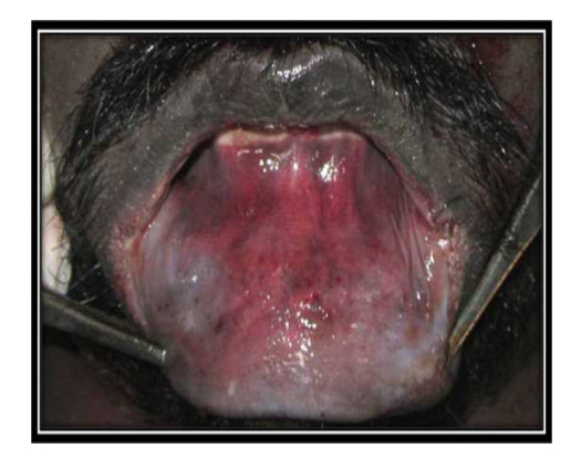
Fig III: Oral manifestations in the case of drowning