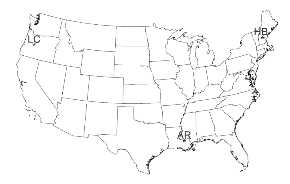
Figure 2 Location of the watersheds employed in the study. HB: Hubbard Brook in New Hampshire; LC: Lookout Creek in Oregon, and; AR: Amite River near Denham Springs in Louisiana

from 2300 to over 3550 mm at higher elevations. In the wintertime, rain is mixed with snow in the lower portion of Lookout Basin and snow is more persistent at higher elevations (above 1000 m). The time-period with the most abundant data falls between October 1, 1998 and September 30, 2011. See www.lternet.edu for more detailed information of the two experimental catchments.