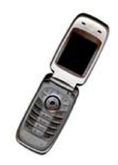
Fig. 2. Example of an unacceptable low-resolution image