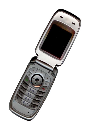
Fig. 3. Example of an image with acceptable resolution