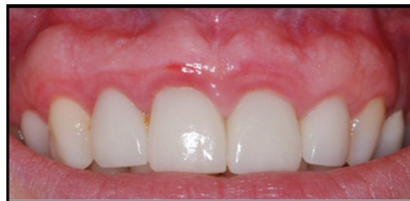
Figure 5: One year, post-crown lengthening with All-Porcelain permanent crowns. After one year the erythematous lesion was significantly reduced.