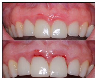
Figure 6: The upper image shows pre-incisional biopsy and the lower image shows immediately post-biopsy from gingival margins of #8 and #9.