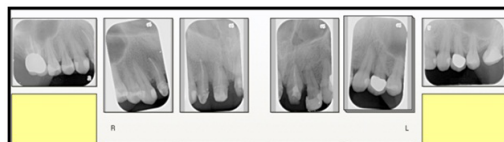
Figure 2: Periapical radiographs showing impingement of the biological width.