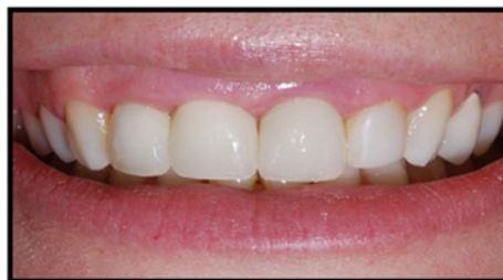
Figure 1: Clinical image at initial presentation shows a high "gummy" smile with provisional crowns.

At 12 weeks post-surgery marked improvement was observed but the lesion had not completely resolved (Figure 4).