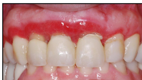
Figure 3: At five weeks post-surgery and three weeks post-Barricade dressing removal, the patient presented with severe gingival erythema mimicking desquamative gingivitis (DG).