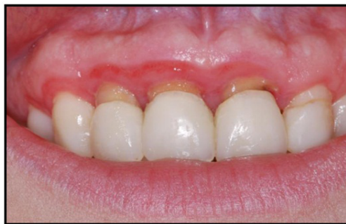
Figure 4: At 12 weeks post-surgery, and after using systemic Prednisolone for 15 days, the lesion was improved but had still not resolved.

Although excisional biopsy has been proposed as the correct treatment for oral focal mucinosis, this was not performed in this case. Rather, incisional biopsy was performed due to the