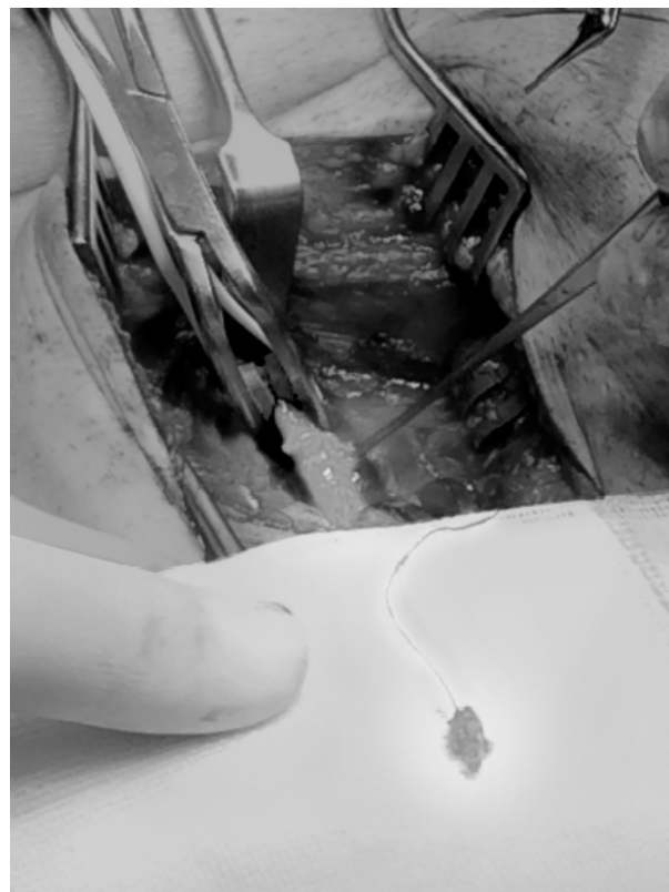
Fig. (2). The Angio-Seal TM was surgically removed through a vertical incision of the common femoral artery.