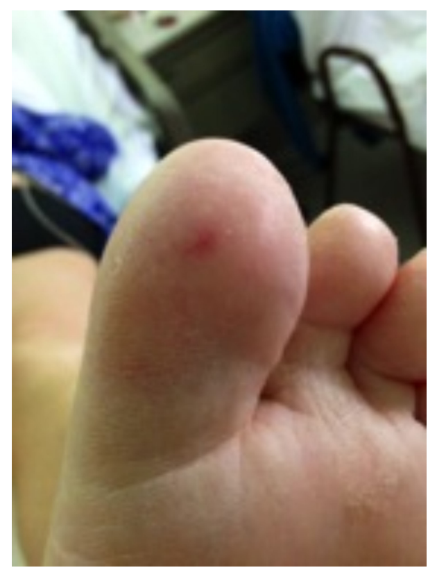
Fig. (1). Peripheral embolism.

The management of TAVI-PVE has not been well established. There are no guidelines for indications and opportunity of surgical treatment, which is the most difficult decision in patients previously ineligible for open procedure due to a high mortality risk prediction.