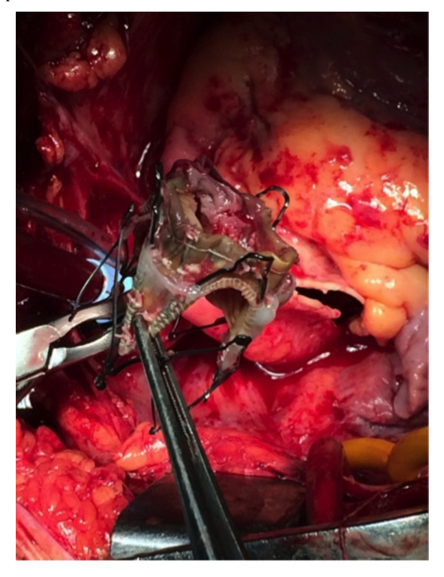
Fig. (4). Ectomized aortic TAVI valve with multiple vegetations.

Health care acquisition and a distant primary source of infection are frequent in TAVI-PVE, as in the case we report. To the best of our knowledge this is the second report of TAVI-PVE due to P. aeruginosa , being the probable source an organ-space SSI. We cannot exclude the presence of PVE at the first manifestation of bacteremia accompanying the empyema, as TEE can have difficulties for detecting small vegetations in patients with TAVI because of the structure of the prosthetic valve and the calcification of the native valve that remains in situ .