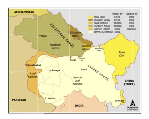
Figure 1: Map of J&K

The climate of Srinagar may be described as a humid continental climate with very warm summers and cold winters. The highest temperature falls around 37 °C and the lowest -14 °C. (Government of J&K, 2012)