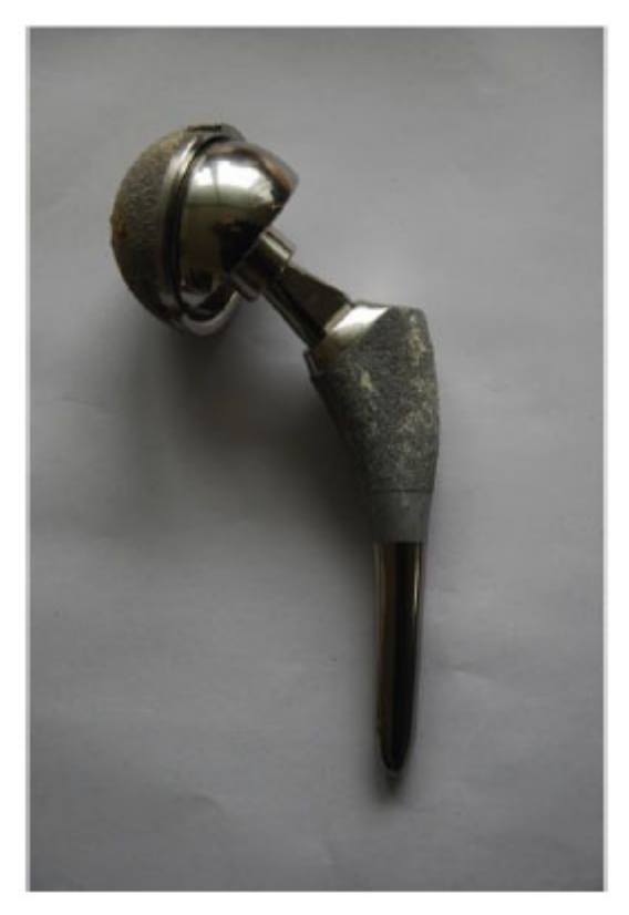
Fig. (1). Metal-on-metal CONSERVE® TOTAL hip system.

During first half of 2012 the awareness about complications regarding the MOM THA became more apparent and patients with a MOM THA were scheduled for clinical evaluation by a senior surgeon and enrolled in the MOM follow up program. This included clinical evaluation, blood samples and radiological evaluation at 1,2,5,7,8 and 10 years after insertion [39].