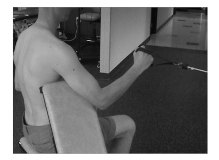
Fig. (3). Internal rotation.