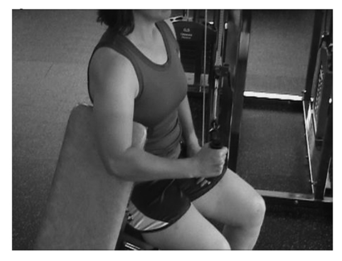
Fig. (2). External rotation.

shoulder in 30 degrees of flexion and 30 degrees of abduction. The maximal score was used as the measurement. Following isometric testing, each participant was placed in a sitting position on a multi-purpose bench with the elbow supported and the shoulder in an open packed position. The starting position included the elbow at ninety (90) degrees of flexion and the wrist in neutral. The pulley and bench were set up in a manner to allow for perpendicular angles of both the pulley rope with the humerus and the pulley rope with the forearm at mid-range. This allowed the rope to remain in the appropriate plane of movement. Resistance was provided by the STEENS pulley at approximately fifteen (15) to fifty (50) percent of the maximum isometric strength assessed during baseline testing. Each participant was then asked to complete active shoulder external (Fig. 2) or internal (Fig. 3) rotation to exhaustion. The screening resistance was adjusted to allow for an adequate number of repetitions to be assessed in the future testing session. Each participant was instructed in the testing procedures and given a testing appointment three weeks later to allow for full recovery from the baseline testing.