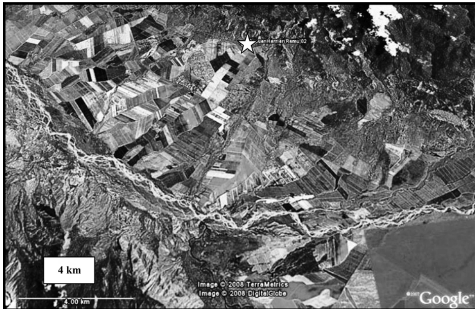
Figure 1. A Google Earth™ image of the Papuan harrier nest site No. 2 (star) in the Ramu Valley Papua New Guinea. The image shows the intensive sugar-cane farming in the Ramu Valley ( S5^{\circ} 57.045' , E145^{\circ} 54.330' ), the Ramu River to the south and already burned cane field. Further dry-season burning reduced the grassland area available and this nest was lost to fire.

population density in both valleys is low but widespread and concentrated around traditional villages (Fig. 1).