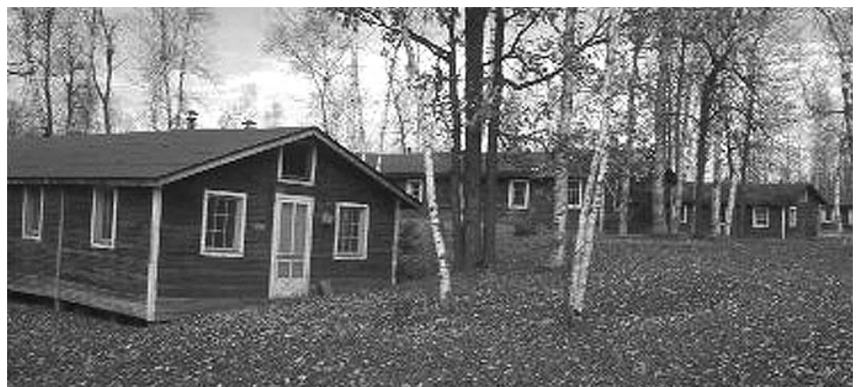
Worker housing at the Rabideau CCC Camp in Beltrami County.

Fewer than 2,500 historic places carry National Historic Landmark designation. Rabideau becomes the 22nd Minnesota property to achieve landmark status. For more information on the NHL program and Minnesota's NHL properties, go to www.cr.nps.gov/landmarks.htm or www.mnhs.org/places/nationalregister/landmarks/index.html . ■