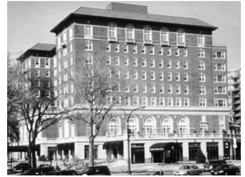
Calhoun Beach Club and Apartments ca. 1940 (left) and after rehabilitation.