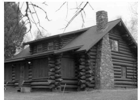
Of the 21 buildings at the Isabella Ranger Station, 12 are log structures built by the Civilian Conservation Corps in the mid-1930s. The station, encompassing an office building, garage, storage shed, oil house, warehouses and dwellings, served from 1934 to 1955 as an administrative center for federal land management initiatives in the Isabella Ranger District of the Superior National Forest.