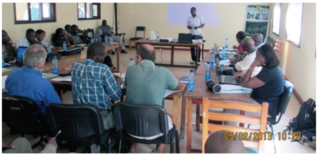
Plate 1: Participants' activities during the ASF elephant action planning workshop.

This action plan addresses the unique conservation needs for the African Elephants occurring within the Arabuko-Sokoke Forest (ASF) in Kenya's north coast (Figure 1). The forest covers 420 Km 2 and is close to the Indian Ocean in Kilifi County about 110 km north of Mombasa. It is one of the last remnant indigenous forests in Kenya, the largest and most intact coastal forest in East Africa, and by far the largest remnant of the forests that once dominated Kenya's coastal fringe. It contains a remarkably high number of species in relation to the area: 20% of Kenya's bird species and about 30% of its butterflies have been recorded in this small part (0.07%) of Kenya. At least 24 rare or endemic bird, mammal and butterfly species are restricted to this stretch of coast. This high proportion of endemic species, some known only from this forest, makes ASF a globally significant biodiversity hotspot. The forest has been designated by BirdLife International as an Important Biodiversity Area.