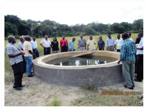
Plate 2: Efforts to artificially supply water for elephants at ASF. The photo shows workshop participants standing around a water trough constructed for elephants at Arabuko swamp.