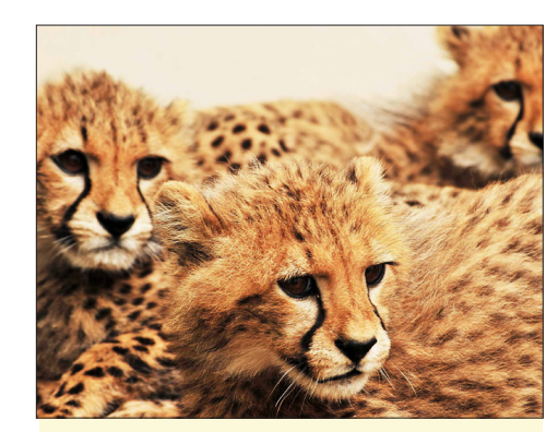
Cheetah cubs at one of the National Parks

There is a proper succession plan in place and even if I were to leave, the organisation would continue to function. I have also put in place strong management systems guided by policies and procedures that ensure the core functioning of the organisation runs