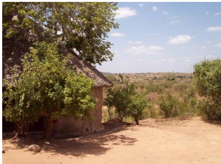
A store at the campsite