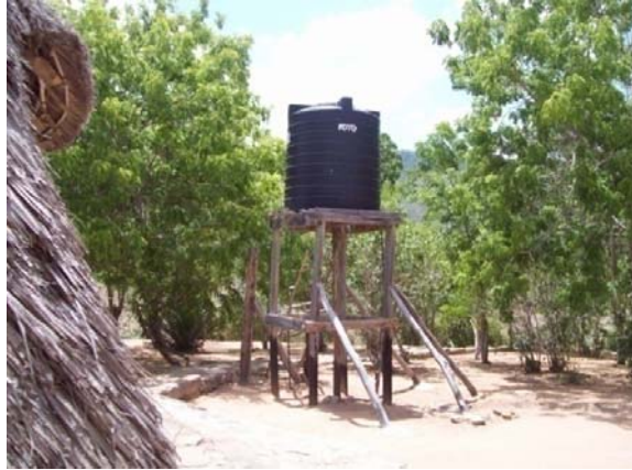
The water tank & surrounding vegetation at the campsite