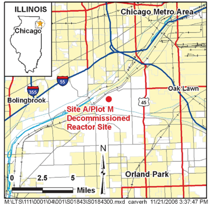
Location of the Site A/Plot M, Illinois, Decommissioned Reactor Site

Operations at Site A began in 1943 and ceased in 1954. The first nuclear reactor to achieve a self-sustaining chain reaction, CP-1, was moved from the University of Chicago to Site A in 1943 and renamed CP-2. A second reactor, CP-3, was constructed on the site in 1943. The fuel for both reactors was natural uranium (uranium in which the natural abundance of the isotopes uranium-234, uranium-235, and uranium-238 has not been altered). CP-3 was dismantled in January 1950 because of suspected corrosion of the aluminum cladding around some of the fuel rods. The natural uranium fuel in CP-3 was replaced with enriched uranium (uranium in which the amount of uranium-235 in the fuel has been increased from its naturally