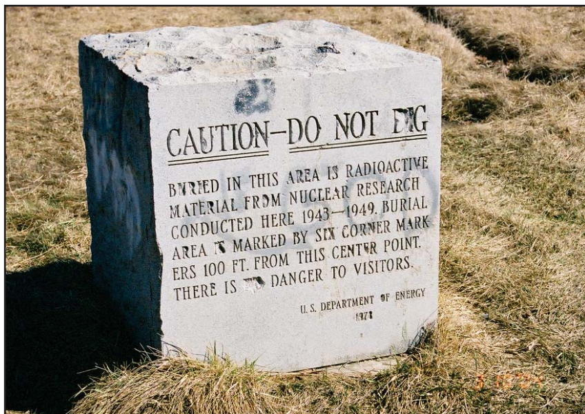
Marker at Plot M

deuterium and oxygen instead of ordinary hydrogen and oxygen) in reactor CP-3' were removed and shipped to Oak Ridge National Laboratory, an AEC facility near Oak Ridge, Tennessee. An excavation approximately 100 feet across and 40 feet deep was prepared between the two reactors. The 800-ton, concrete-filled shell of CP-3' was buried by excavating around it on three sides and detonating strategically placed explosives in the earthen "pedestal" supporting it. The reactor shell rolled and ended upside down in the excavation. The buildings that housed the reactors were demolished. The concrete shield of CP-2, the only remaining portion of that reactor, was demolished with a wrecking crane and pushed into the excavation, which was then filled, leveled, and landscaped. By 1956, all buildings and equipment at Site A had been decontaminated and demolished.