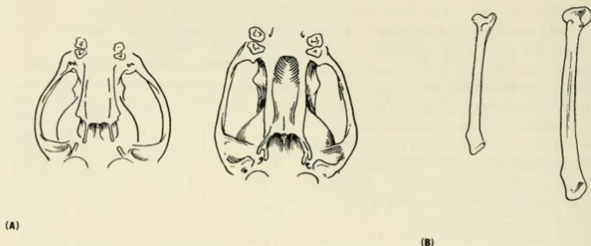
Fig. 3. A ventral view of N. nasua (left) and N. narica (right) demonstrating a feature of the palate; (b) Bacula of N. narica (left) and N. nasua (right).

late foods increase in size. Although the mainland coatis are generalists, the Cozumel coati may not be. This study suggests that the Cozumel coati is specializing on smaller prey items, but additional study of its ecology and behavior is necessary.