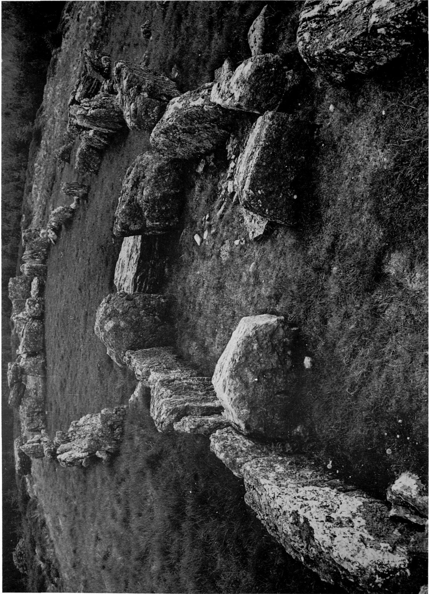
Deer Park or Magheraghanrush (Sl. 47) from the rear of the western gallery.