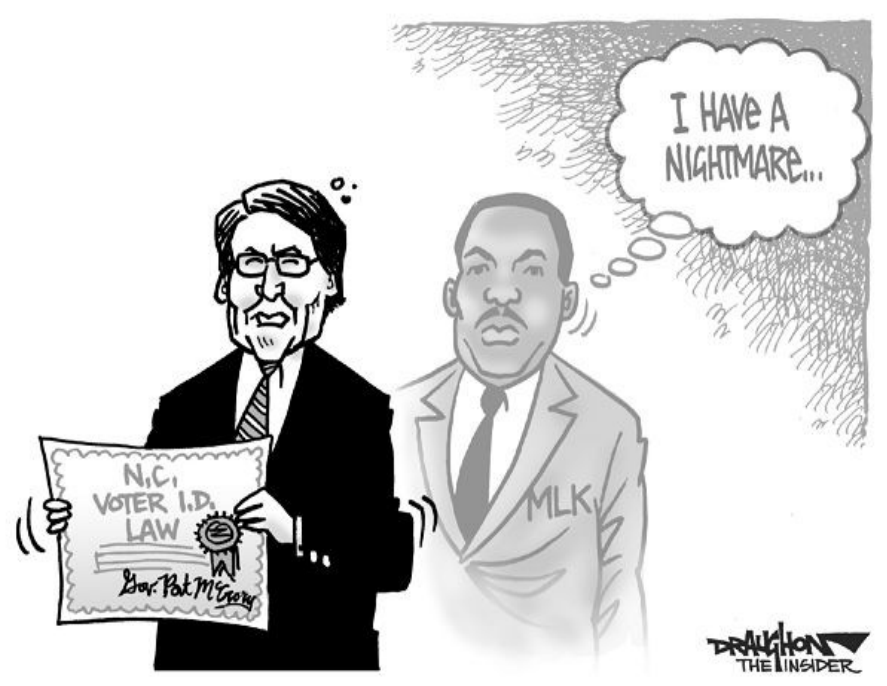
By Dennis Draughon