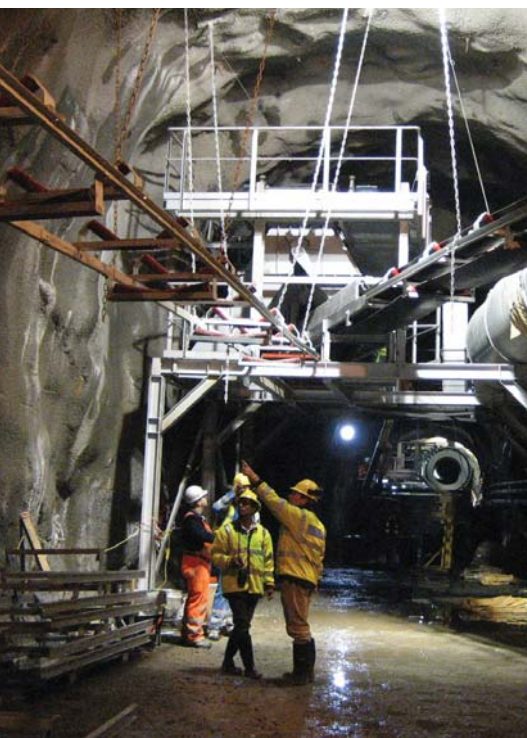
Cutting through 100m of finished tunnel per week, Eliza Jane gets into her stride

“But we also benefit from the fact that there is no scheduled servicing, 25 years expected lifetime, no loss of efficiency – unlike fossil fuel boilers - no fuel tank or flue and a couple of hundred tonnes less in CO2 emissions!”