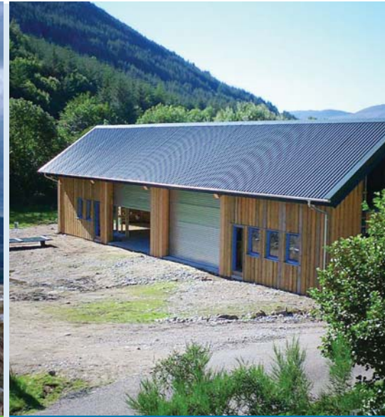
The only way is up. Chillwind's new purpose-built offices in Glenelg.