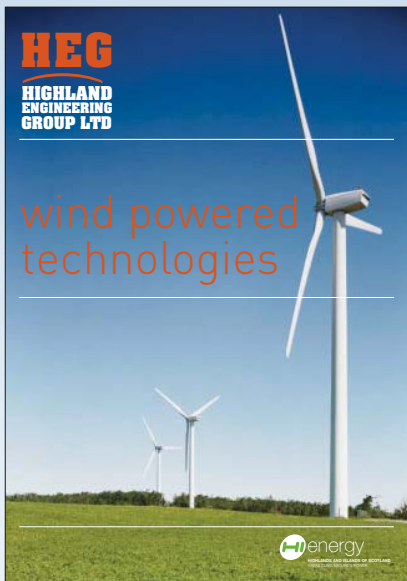
Stakeholder literature A4 brochure cover

Download a copy of the DVD at http://www.hi-energy.org.uk/projects-video.html and to book a brand consultation contact the HI-energy team on info@hi-energy.org.uk