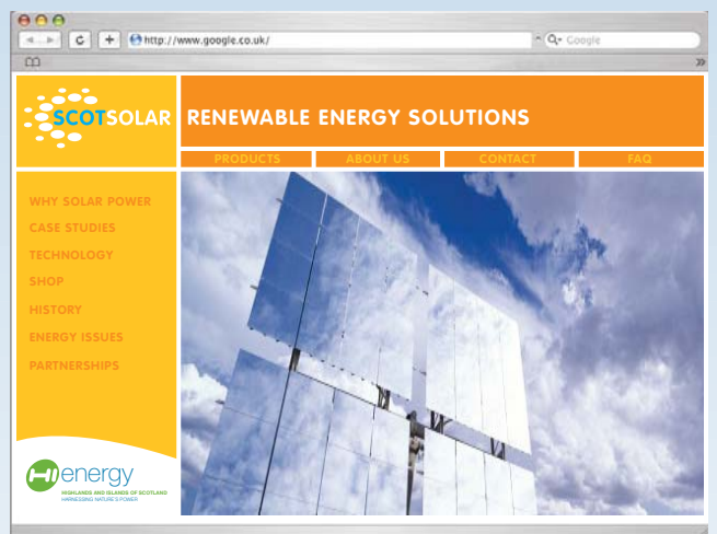
Stakeholder web site