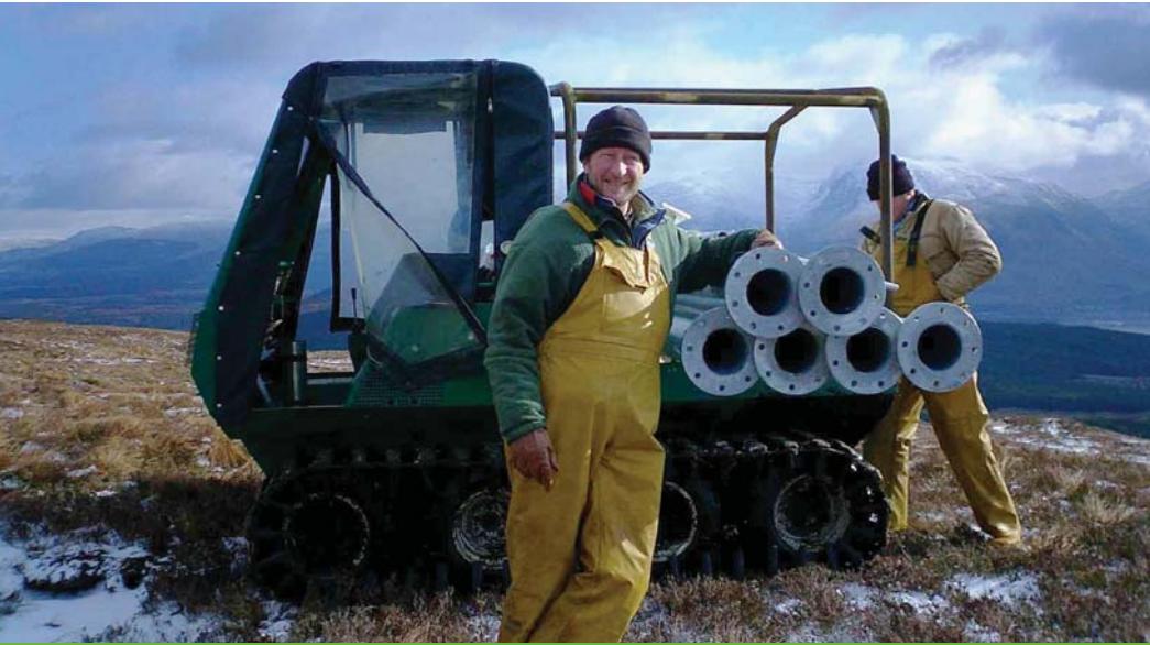
In the bleak mid winter. The Chillwind team get ready to install a wind monitoring system at Druim and Arkaig.