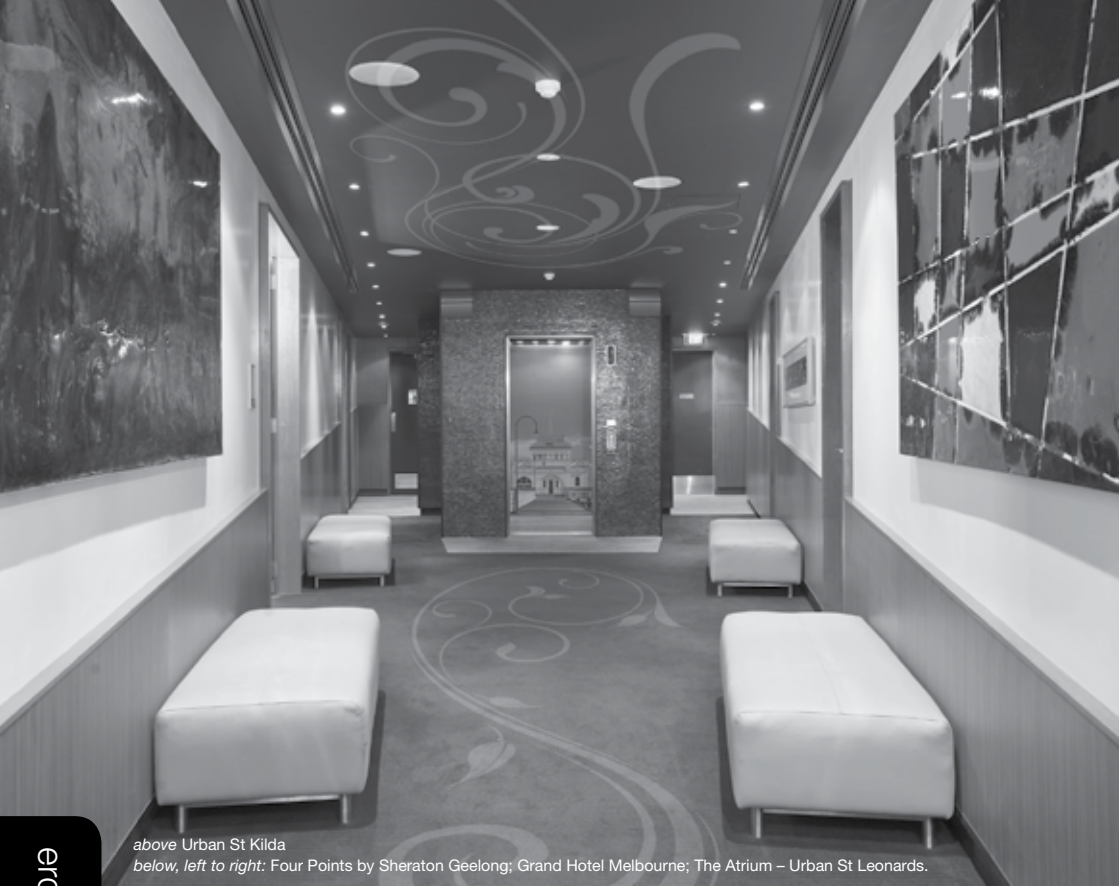
above Urban St Kilda below, left to right: Four Points by Sheraton Geelong; Grand Hotel Melbourne; The Atrium – Urban St Leonards.