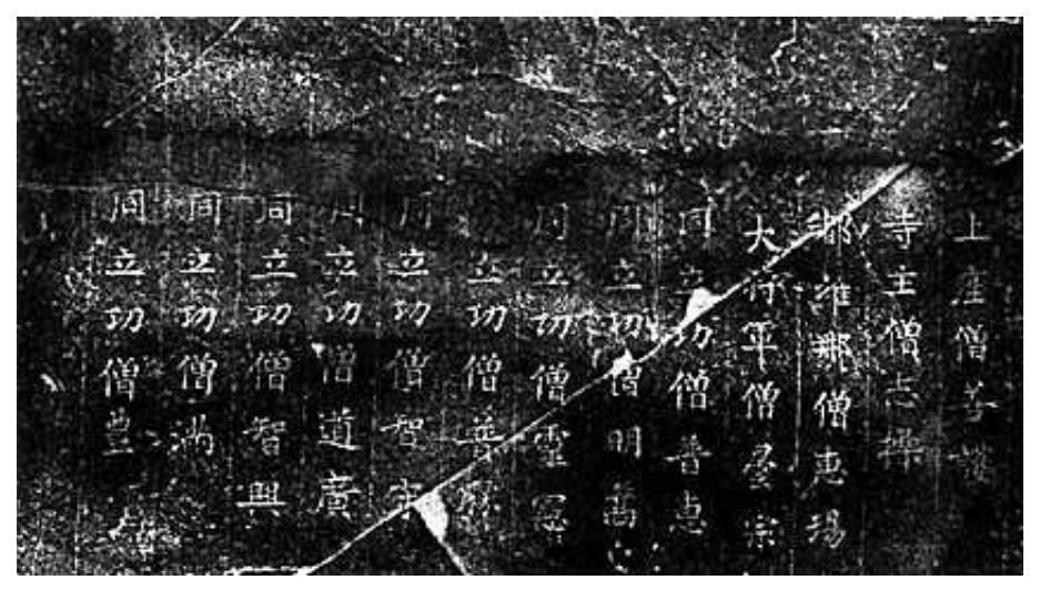
<u>Figure 2. List of Thirteen Heroic Monks</u> Inscribed on "Shaolin Monastery Stele"; photograph by author.

The official letter of 632 noted that following their Cypress Valley victory several Shaolin monks had been offered official posts, which, with the exception of Tanzong, they politely declined. It is conceivable that the monks in question are the thirteen listed in Text 7. However, it need be emphasized that the text itself does not date from Li Shimin's