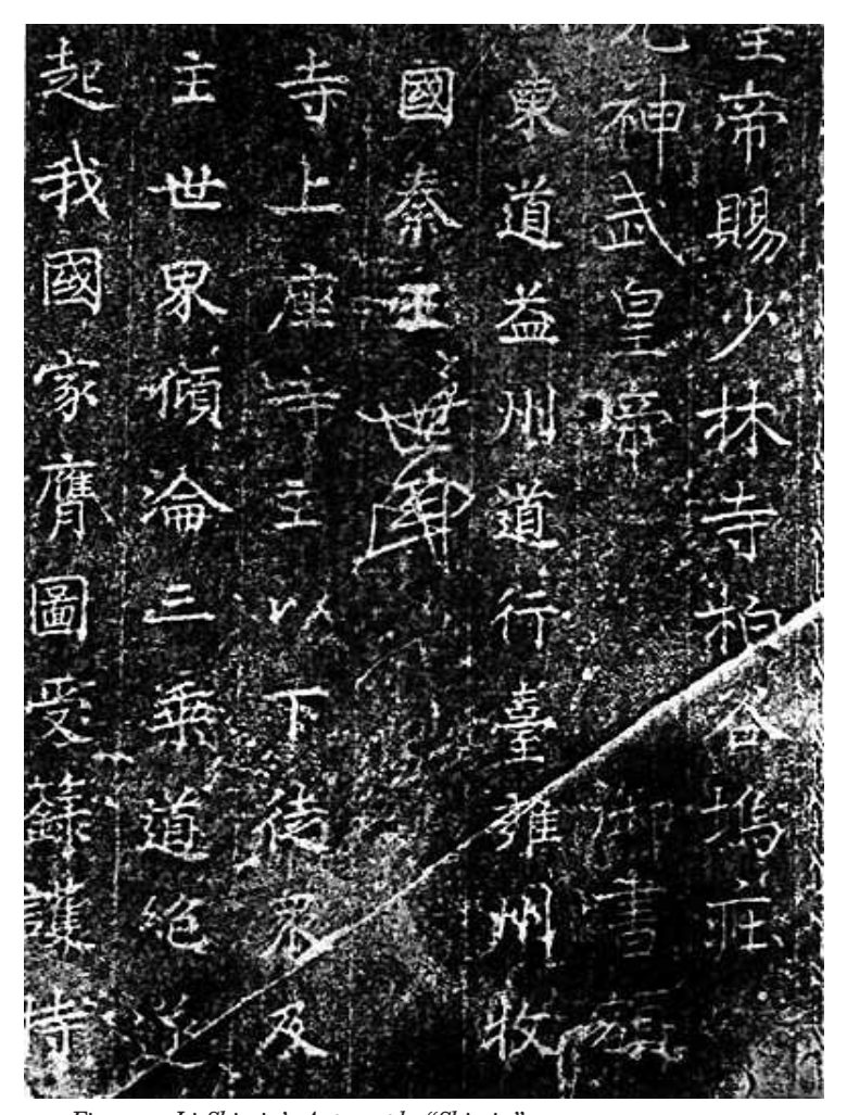
<u>Figure 1. Li Shimin's Autograph, "Shimin"</u> As copied onto "Shaolin Monastery Stele"

well as to the military and civil leaders, officers, common people, and the rest.