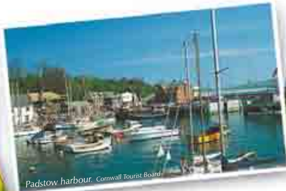
Padstow harbour.