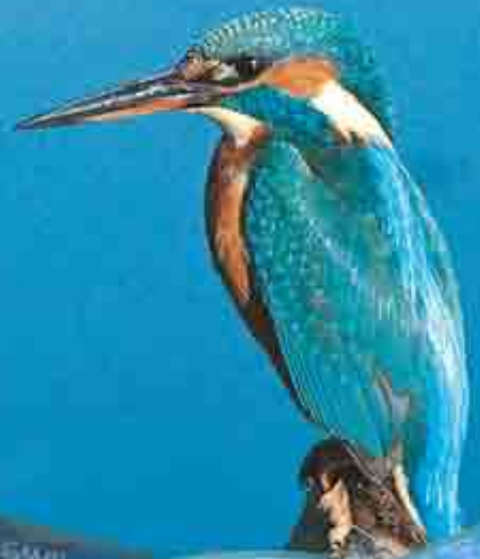
Cornwall Wildlife Trust / JB & S Bottomley