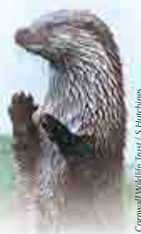
Cornwall Wildlife Trust / S Hutchings