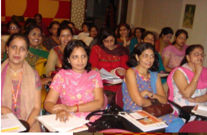
TEACHERS ENHANCING THEIR SKILLS AT THE BRAINSTORMING SESSION