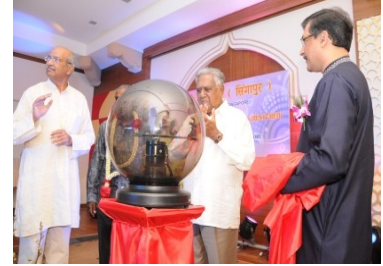
PRESIDENT NATHAN DECLARES THE NEWLY RESTORED MAHATMA GANDHI MEMORIAL OPEN