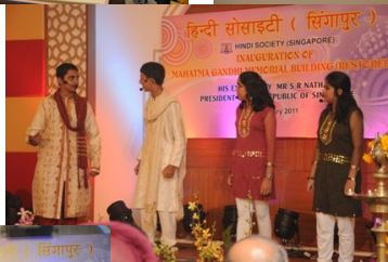
SKIT ON GANDHIAN VALUES