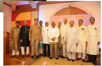
MEMBERS OF THE MANAGEMENT COMMITTEE WITH THE PRESIDENT