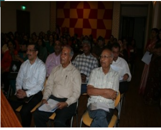
MEMBERS OF THE MANAGEMENT COMMITTEE AT THE WORKPLAN SEMINAR 2011

The academic year of 2011 got off to an invigorating start with the work-plan seminar organized on 3 Jan 2011. All the teachers and members of the management committee were present as new plans for the year ahead were announced. The plans of streamlining the book sales, fees payment and collecting feedback from the parents were discussed. The manage-