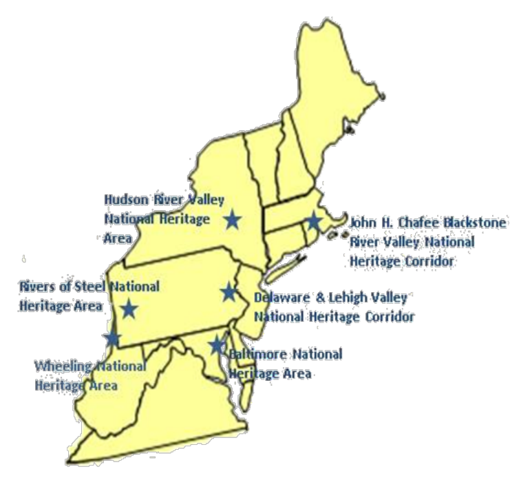
Six National Heritage Area Case Study Sites in the Northeast Region

revenue generation and economic impacts through a protocol comprising of interviews, focus groups, economic impact analysis, and secondary data analysis. Additional extrapolations estimate the national economic benefit of all NHAs. The research protocol included site visits to each of the six NHA regions listed in Table 1, focus groups, and interviews with key stakeholders within the six NHA regions, facilitation and data collection of existing NHA visitor estimates, operating budgets, and grant/awards information. The data collection process guided the economic impact analysis, and subsequent estimations, using IMPLAN economic impact software.