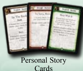
Personal Story Cards

The new investigator cards add a new type of investigator card to the game – personal stories. Every investigator, even those from Arkham , Dunwich and Kingsport Horror , now has his own personal goal to achieve over the course of the game. Personal stories are described in more detail on page 10.