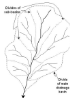
Fig. 2. Schematic diagram showing a drainage divide, the boundary of a drainage basin.

The term “continental divide” refers to a particular type of drainage divide. Unfortunately, various references provide different definitions for continental divide. Consequently, there