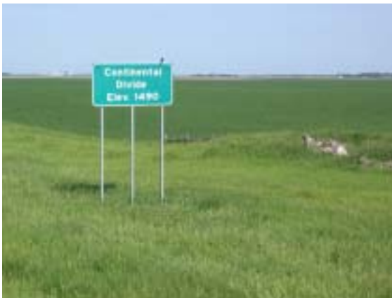
Fig. 1. View of the continental divide from I-94 in eastern North Dakota.

To many travelers of I-94, the sign appears to be a mistake, or perhaps a self-deprecating joke dreamt up by the North Dakota Tourism Office to make light of one of the flattest landscapes in the world. In reality, the sign is no mistake and no joke. I suspect that the perception of error is due, in part, to the misconceptions contained in countless textbooks and maps from reputable map makers, who propagate a myth that there is only one continental divide in the United States and North America. Too many geography textbooks and maps show only one continental divide—the one along the crest of the Rocky Mountains. Indeed, most sources even refer to it as The Continental Divide , treating it as a singular and unique feature, furthermore as a formal place name complete with capital letters.