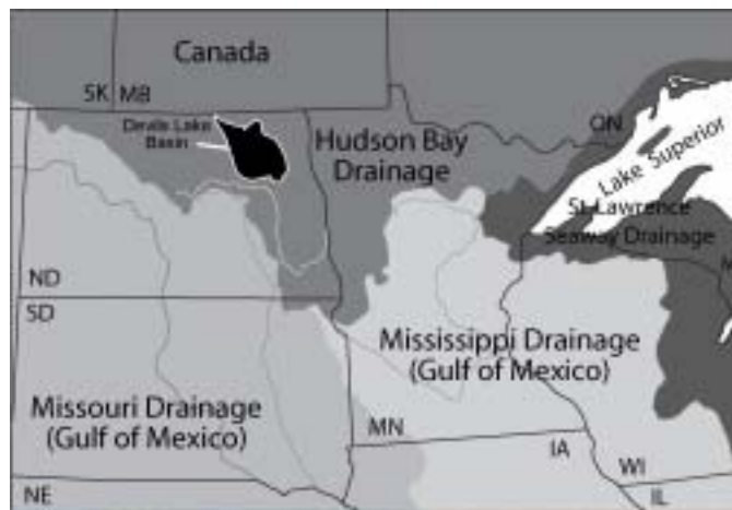
Fig. 4. Map of the interior of North America illustrating the continental divides and major drainage basins of the area.

Many people have argued that the crest of the Appalachian Mountains is also a continental divide, commonly referred to as the Eastern Divide. The Eastern Divide does separate eastward flowing streams, which cross the Piedmont and Coastal Plain and empty into the Atlantic Ocean, from