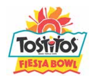
Tostitos Fiesta Bowl Jan. 3 • Glendale, Ariz. 8:30 p.m., ESPN