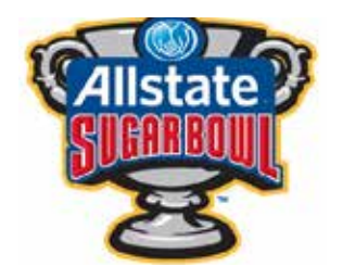
Allstate Sugar Bowl Jan. 2 • New Orleans, La. 8:30 p.m. ET, ESPN