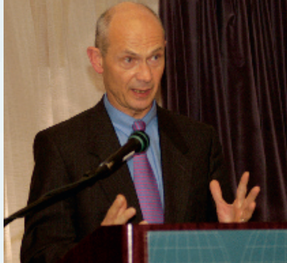
European Union Commissioner for Trade Pascal Lamy gives the keynote address at the 2003 Transatlantic Journalists Forum.

Transatlantic Journalists Forum: Following the success of last year's first annual Transatlantic Journalists Forum (TJF) in Brussels, GMF, in cooperation with the European Commission, held the second TJF in Washington, DC, from June 25 to 27. Similar to last year's Forum, this one brought together some 30 American and European journalists who cover transatlantic issues to exchange views and hear from high-level policymakers from both sides of the Atlantic. The group addressed a wide range of pressing topics, including Iraq, immigration, the Israeli-Palestinian conflict, agriculture, and EU enlargement. Next year's TJF is scheduled to take place in Brussels in early 2004.