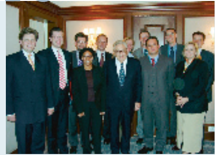
German policy and opinion leaders with former U.S. Secretary of State Henry Kissinger