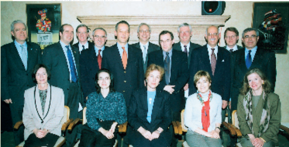
GMF and USAID welcome Balkan region ambassadors at the Balkan Trust for Democracy launch event in Washington, DC.