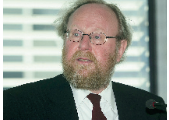
Wolfgang Thierse, president of the Bundestag, addresses participants of the 2003 Bundestag Forum on the United States.