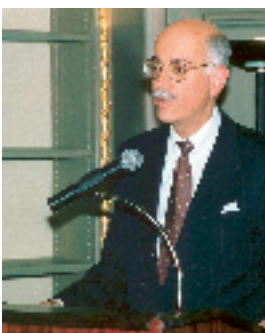
Andrew S. Natsios, administrator for the United States Agency for International Development, speaks at the inauguration of the Balkan Trust for Democracy held in Washington, DC.

The Environmental Partnership for Central and Eastern Europe (EPCE) was launched in 1991 by GMF, the Rockefeller Brothers Fund, the Charles Stewart Mott Foundation, and the Atlantic Philanthropies. EPCE is a consortium of national environmental organizations focused on fostering community-based environmental action and citizen participation in Central Europe. Today, it is comprised of six independent grantmaking and technical assistance foundations in Bulgaria, the Czech Republic, Hungary, Poland, Romania, and Slovakia. In 2003, EPCE's focus both nationally and as a regional group was on renewable energy, sustainable agriculture, land stewardship and the development of greenways systems, watershed management, and more effective environmental management through public–private partnership