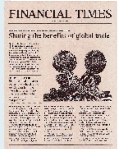
TPF co-chairs Robert Rubin, Dominique Strauss-Kahn, and Shoichiro Toyoda urge leaders of the Group of Eight to prioritize Doha Round of WTO negotiations.

In the coming year, TPF will turn its attention to how to respond to the breakdown of trade negotiations in Cancún, and how to advance broad development goals, both inside and outside the global trading system.