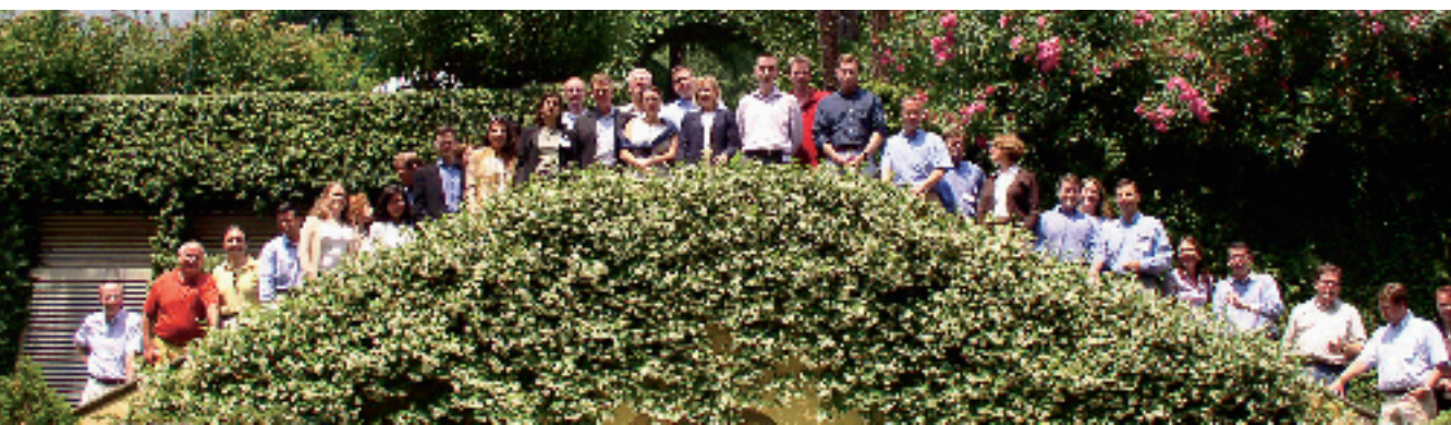
Right: Farm visit on U.S.–European journalist study tour