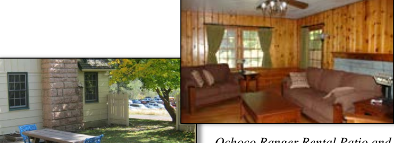
Ochoco Ranger Rental Patio and Living Room

*Carryover funds will be used for large projects and the following season's startup costs.