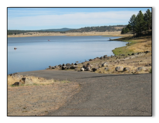
Antelope Flat Reservoir Campground Boat Launch