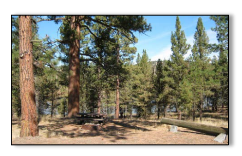
Antelope Campground Campsite