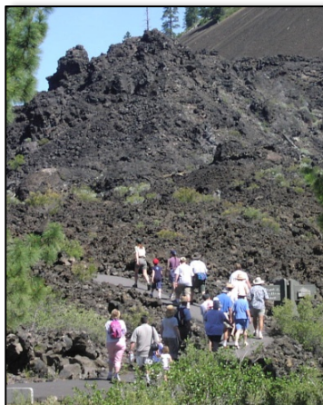
Interpreter led hike on Molten Land Trail