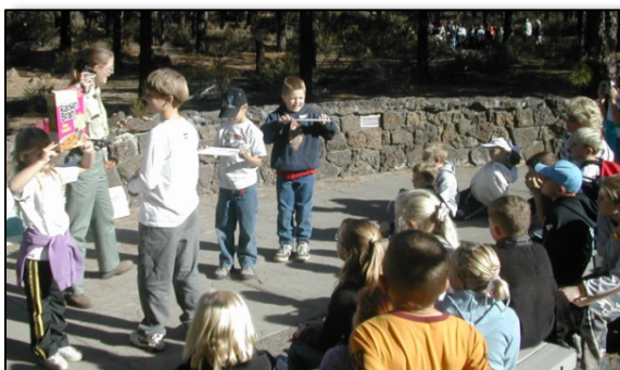
A children's program is held on the patio of Lava Lands Visitor Center.