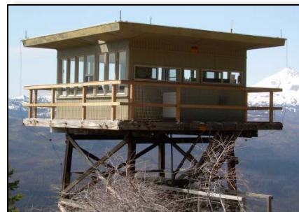
Green Ridge Lookout Rental