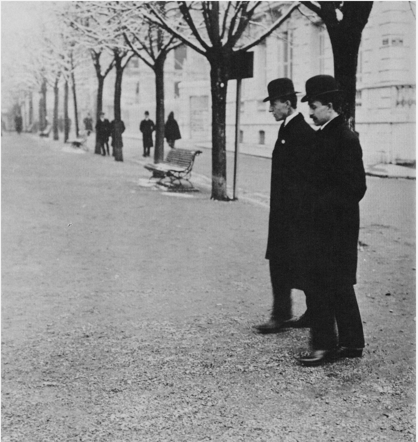
Wilbur and Orville Wright walking on the Boulevard des Pyrénées, Pau, France, in January 1909.