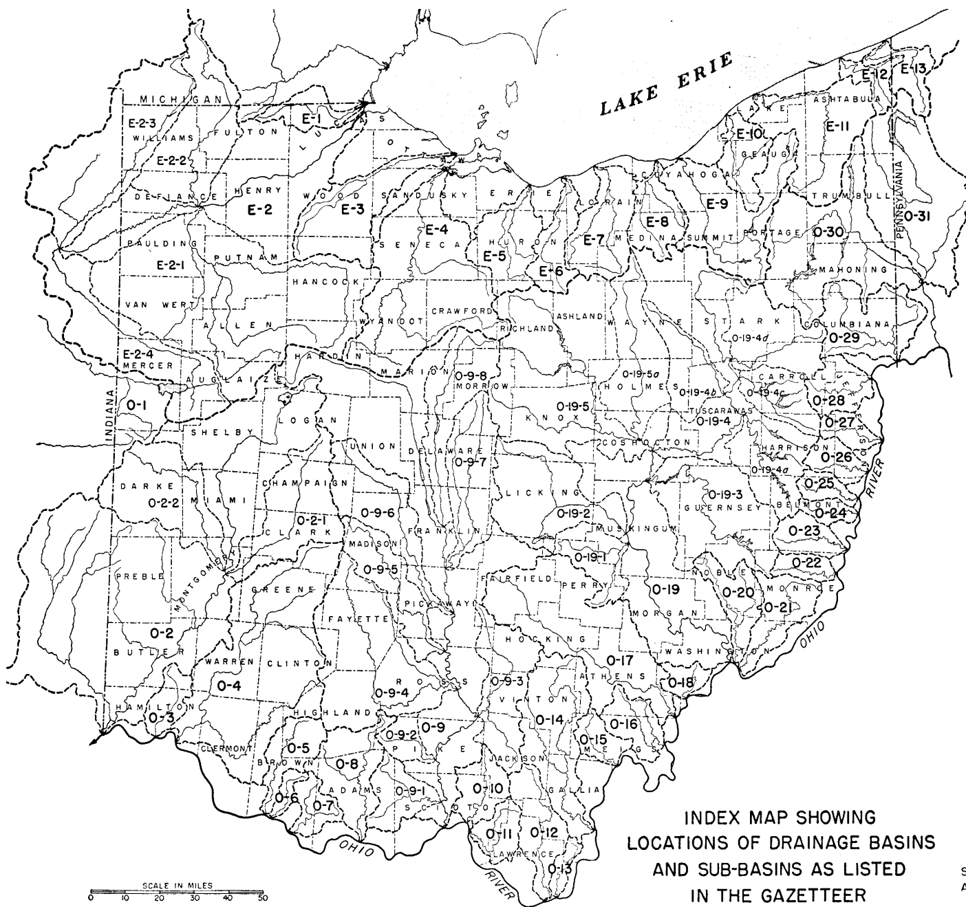
INDEX MAP SHOWING LOCATIONS OF DRAINAGE BASINS AND SUB-BASINS AS LISTED IN THE GAZETTEER