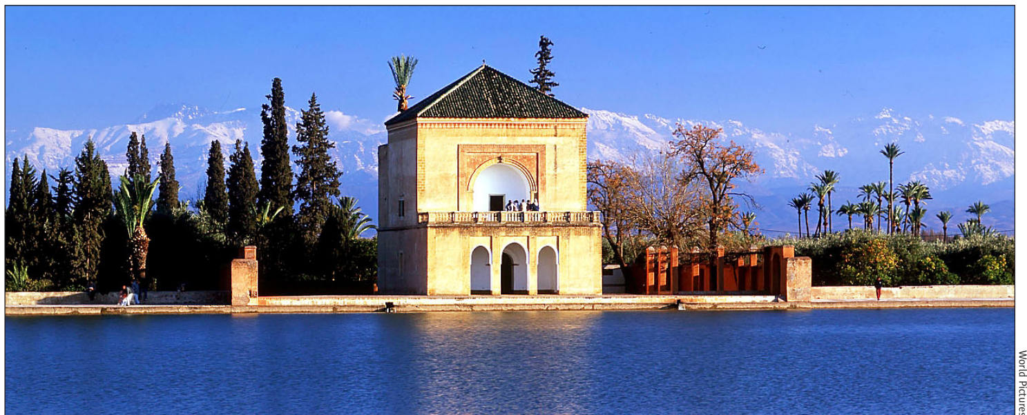
The stunning Menara Park Pavilion is one of Marrakech's most lovely settings. The city, with its Atlas mountains backdrop, is proving a hit with UK investors

As soon as you land at Marrakech airport you see the scale of development under way. The country's ruler, King Mohammed VI, aims to double visitor numbers to 10 million by 2010, and the current airport